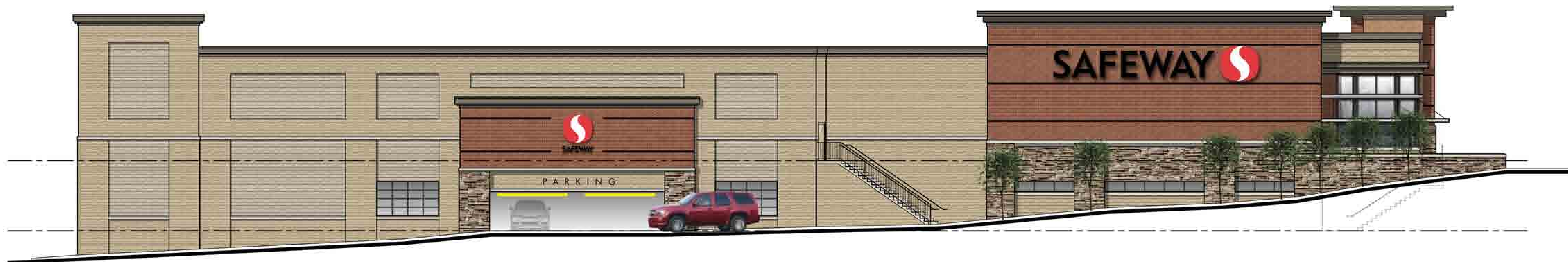
3 LEFT SIDE ELEVATION SCALE: 1/8" = 1'-0" REF: 2/4&L 2/4&L 4/4&L