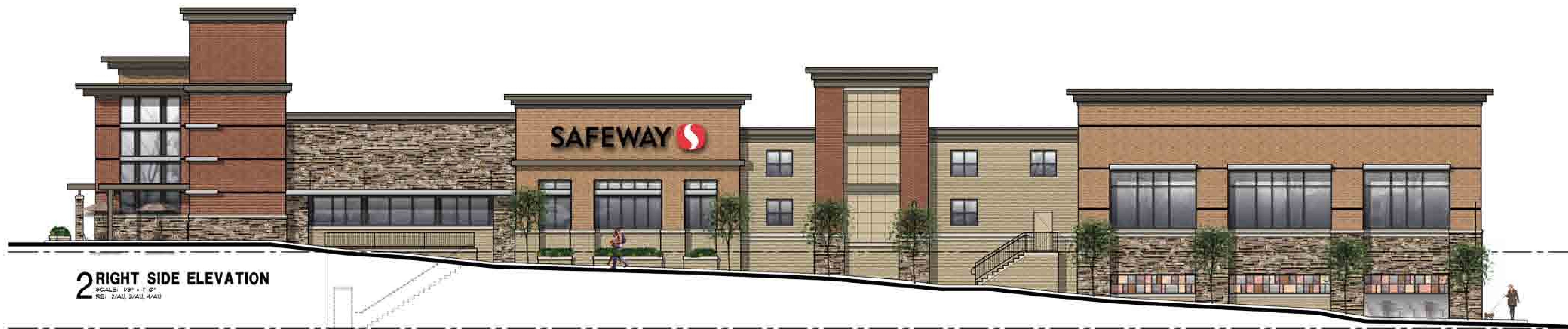
2 RIGHT SIDE ELEVATION SCALE: 1/8" = 1'-0" REF: 2/4&L 2/4&L 4/4&L