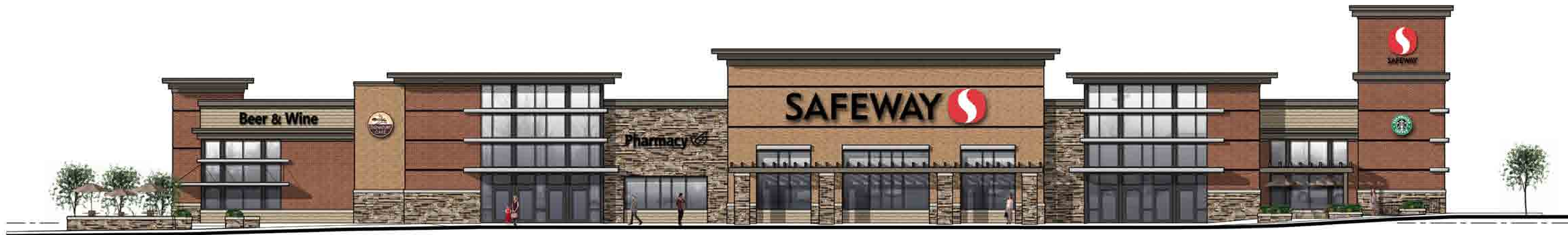
1 FRONT ELEVATION SCALE: 1/8" = 1'-0" REF: 2/4&L 2/4&L 4/4&L